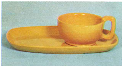
SOUP AND SANDWICH SET 4SC—11 OZ. SOUP CUP 3.75 6P—11" PLATTER-TRAY 4.50