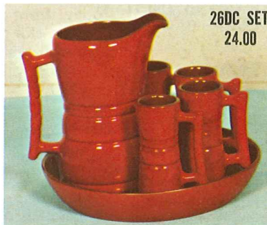
26DC SET 24.00 26D—1 QT. PITCHER 26DC—3 OZ. JUICE 6.50 91—TRAY 3.25 4.75