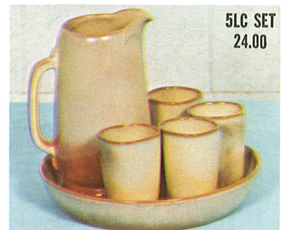
5LC SET 24.00 81—1 QT. PITCHER 5LC—6 OZ. JUICE 6.50 91—TRAY 3.25 4.75