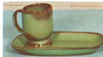
COFFEE AND DESSERT SET 3.75 5PS—9" PLATTER-TRAY C2—10 OZ. MUG 3.25 (or choose your own style Mug — See Pg. 9)