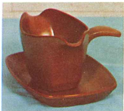
6S—TWO-SPOUT GRAVY 5PS—9" PLATTER-TRAY