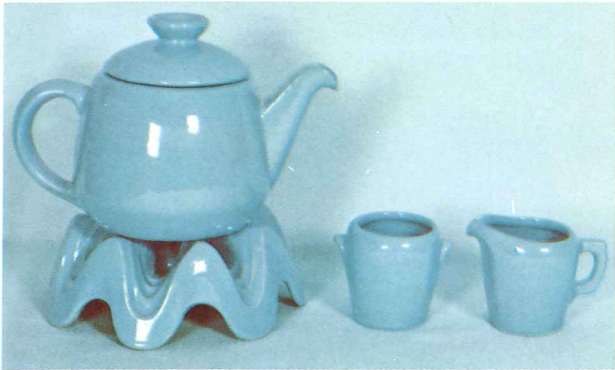
6T—6 CUP TEAPOT 9.25 5DA—6 OZ. CREAMER 3.25 WA3—6" WARMER W/CANDLE 5.00 5DB—6 OZ. SUGAR 3.25