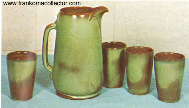
9.25 80—2 QT. PITCHER 5L—12 OZ. TUMBLER 3.75