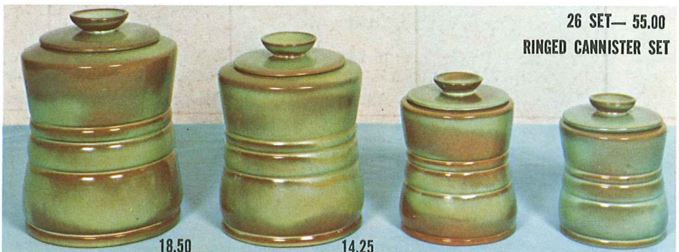
26 SET— 55.00 RINGED CANNISTER SET