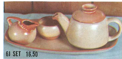
6J SET 16.50