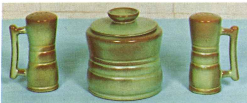
26G—SUGAR/GREASE 26H—SALT & PEPPER 9.25 4-PIECE SET/BOXED 6.00 15.00